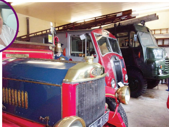
The fire engines at Amberley Museum