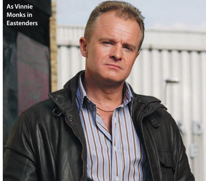
As Vinnie Monks in Eastenders