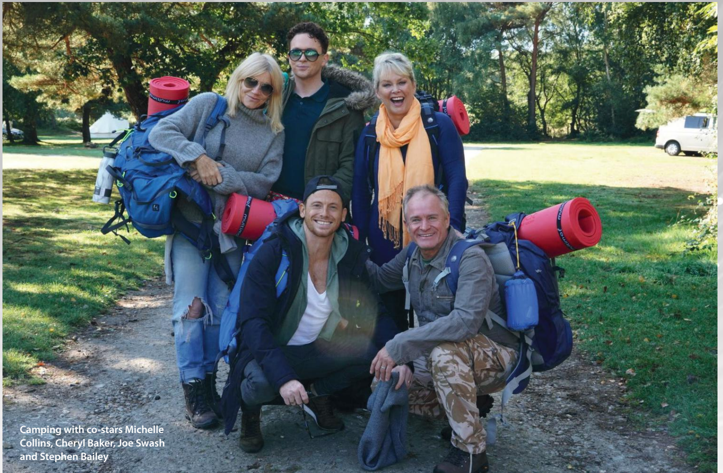
Camping with co-stars Michelle Collins, Cheryl Baker, Joe Swash and Stephen Bailey