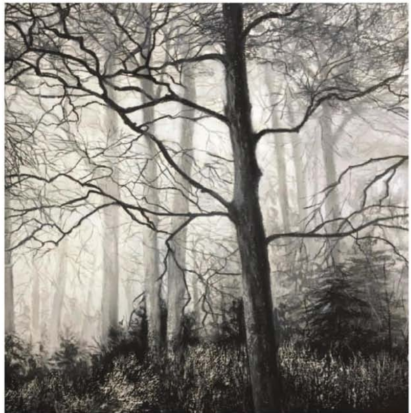
A work in progress

Her favourite time of year is spring and the month of May "when the bluebells appear in the woods and the trees are beginning to come to life" but she concedes that all the seasons are inspiring. "I also love September and the autumn when the leaves change into wonderful colours and the winter when the sea is rough."