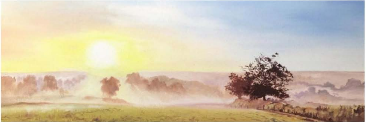
Misty morning along the River Otter behind Lynda's house, in oil

I used to live in the city," she says. Lynda finds Devon hugely inspiring. "I love the river valleys and the rolling hills, the verges along the roads with high hedges and wildflowers, the Jurassic coastline with the pebble beaches, rough seas and calm seas as well as the changing colours on the fields and trees as the seasons change. An artist's dream."